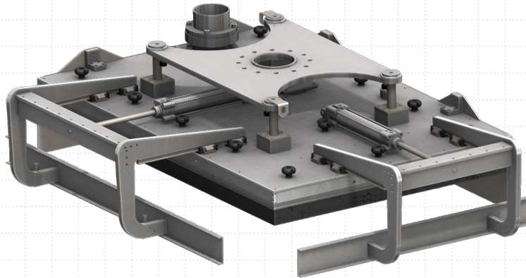
Linear Side Clamps, one corner with fixed sides

Side clamps can be used both for clamping in order to give additional security to the UniGripper by clamping the products or in order to stabilize the products in case that excessive lateral acceleration is needed. The main difference in the side clamps is the way they are set up, meaning that they can be fold down or linear. There are versions which clamp only on one side, two sides, against fixed plates or linear from all four sides. Each product and application requires an analysis to see which of our solutions suits best.